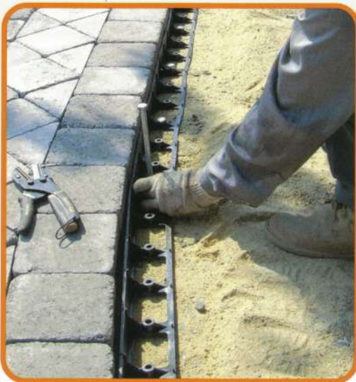
Installs quickly and easily.